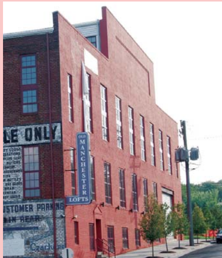
Manchester West The Old Manchester Lofts 815 Porter Street Loft 315 Loft 215 Loft 115