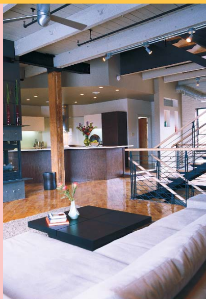
Manchester East The Decatur 39 East Third Street Unit C Unit B