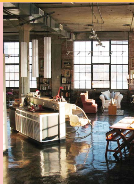
Warehouse 201 201 Hull Street Loft 52