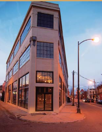
Jackson Ward 401 Brook Lofts 401 Brook Road Unit 3