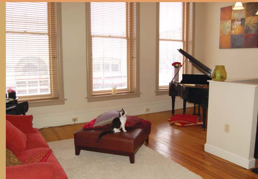
Broad Street Popkin Lofts 121 West Broad Street Loft 201